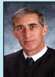
Judge Harris Hartz US Court of Appeals 10th Circuit