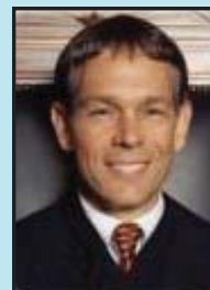
Justice Scott Bales Arizona Supreme Court